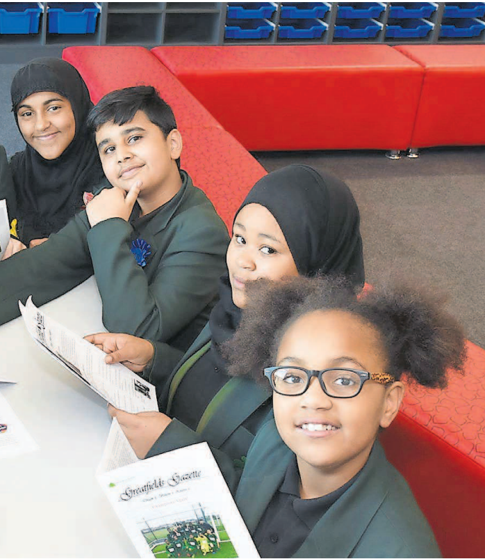
Greatfield School students affected by the recent stabbing and shooting on the Gascoigne Estate have put out a special newspaper edition which talks about the dangers in the community and advice on how to keep safe.