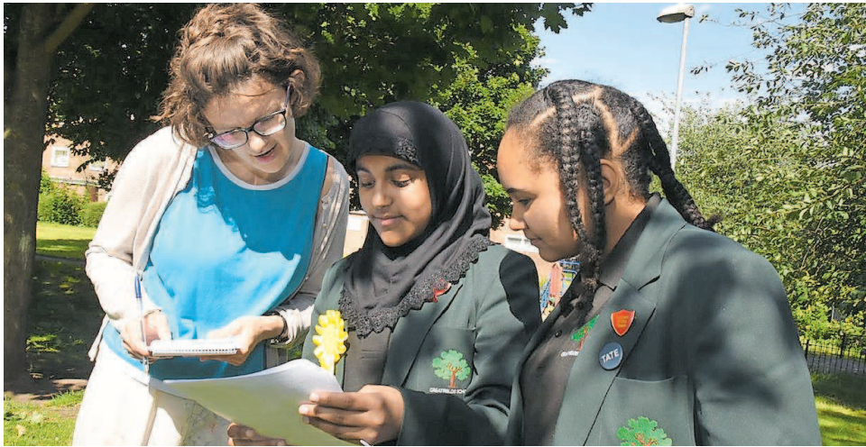
Greatfield School students affected by the recent stabbing and shooting on the Gascoigne Estate have put out a special newspaper edition which talks about the dangers in the community and advice on how to keep safe.